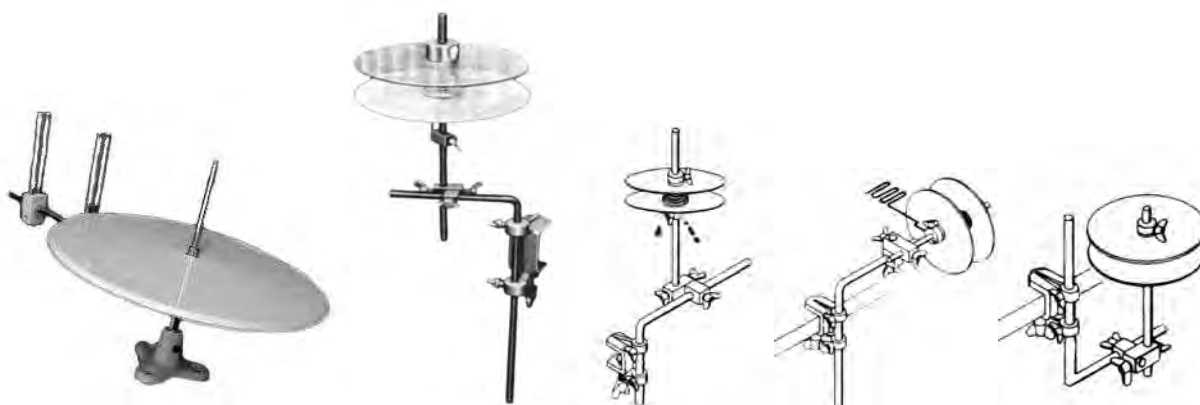
A963Y portarotolo con tensione A964/TS4 portarotolo posizionabile