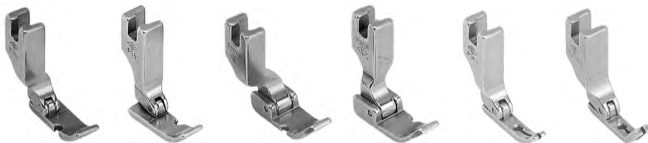
A655 sinistro A655SD c/salvadito A655E economico (31358HW) A656 destro A656SD c/salvadito A656E economico (12435HW) A655W sinistro extra largo (P36LW) A656W destro extra largo (P36W) A658 A658SD c/salvadito A658E economico (40322SH) A659 A659SD c/salvadito A659E economico (165010H)