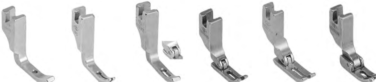
A658R cerniere rigido (40322) A8000 cerniere rigido (165010) A8001 cerniere rigido A8001H snodato (CS40322/40322H) A658W ciabatta pari A658WSD c/salvadito (121946) A660 ciabatta pari largo A660SD c/salvadito (142058) A661 ciabatta stretta A661SD c/salvadito (142058N) A661E economico