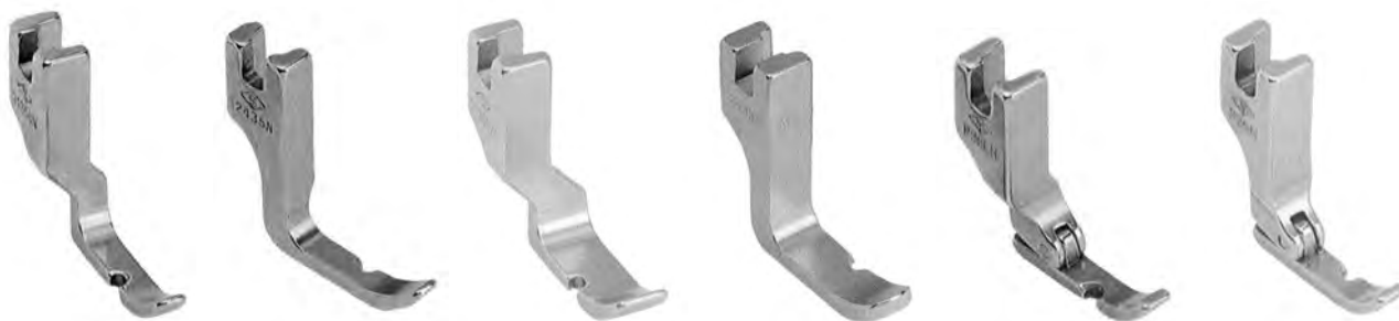
A650 sinistro A650SD c/salvadito (31358N) A652 destro A652SD c/salvadito A652B g.basso (12435N) A651 sinistro A651SD c/salvadito (31358W) A653 destro A653SD c/salvadito (12435W) A654 sinistro A654SD c/salvadito A654E economico (31358HN) A657 destro A657SD c/salvadito A657E economico (12435HN)